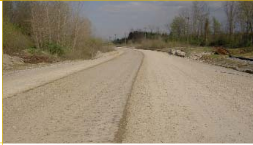
Initial pass with Haul Pro™. Untreated haul road.